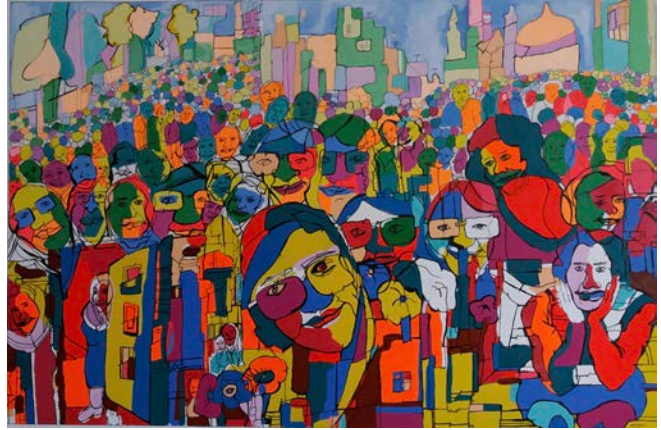
Peace and Happiness Fatemeh Aghakabiri Oil on canvas 30*40