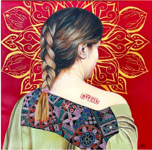
Refused Farideh Salimi Oil on canvas 23*23