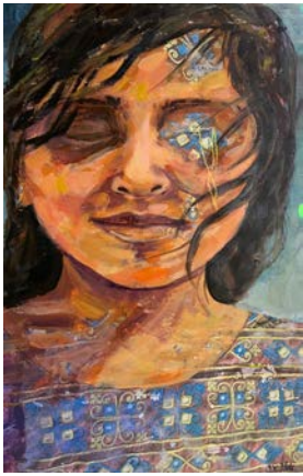
Without title Fatemeh Amani Rad 1981 Acrylic on paper 11*17